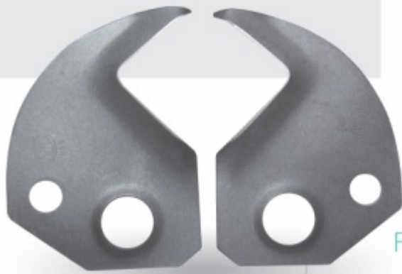
FOR BLOWING MACHINE