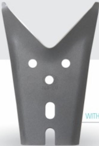
SINGLE GOB WITH LUBRICATION HOLES