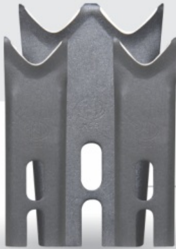
QUADRAL GOB SET