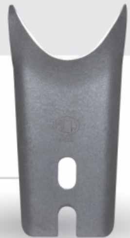
DUBBLE GOB R20