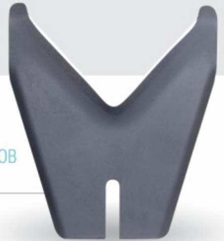
SINGLE GOB BIG SIZE