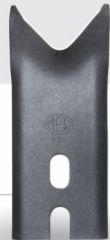
TRIPLE GOB 2.7/8