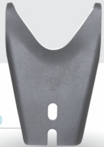
SINGLE GOB R20