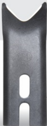
TRIPLE GOB 2.1/8